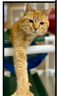
DIZZY is available for adoption