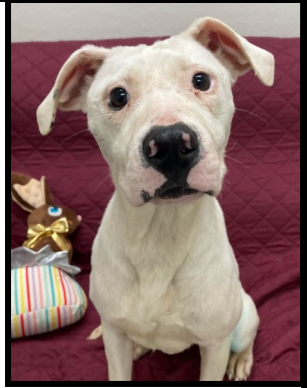
MADELINA is available for adoption

Humans have 5 recognized senses. We taste, touch, smell, see, and hear. Dogs have the same 5 senses, but they aren't all the same as ours. Humans can discern a broader color spectrum and more visual detail than dogs, because we have more color-detecting cells (cones) in the eye. Dogs see better in the dark than humans, because they have larger pupils that let in more light, and more light-sensitive cells (rods) in the center of the retina. Dogs can also detect tiny movements that we may miss, making them good hunters. Dogs have a great sense of smell. Their noses function about 10,000 times better than ours do. Humans have a better sense of taste than dogs. We have about 9,000 taste buds compared to about 1,700 in a dog. Dogs can hear much higher frequencies than humans and can hear at much longer distances.