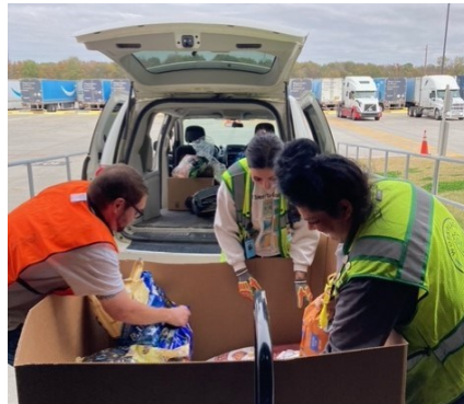
Amazon loading a truck bound for HSPC