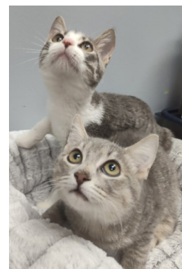
Sabin & Graphitee are available for adoption

★ If the cats fight repeatedly, you may need to start the introduction process all over again and consider getting advice from a veterinarian or animal behaviorist. Never try to break up a cat fight by picking up one of the cats. You're bound to get hurt.