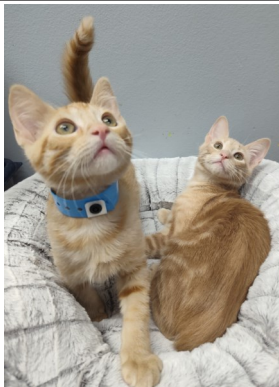
Sam & Hermes are available for adoption