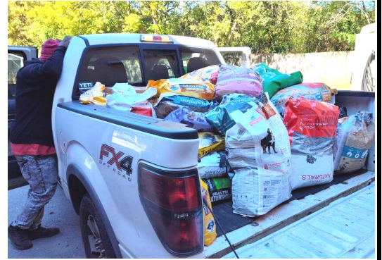
HSPC loading a truck bound for other rescues