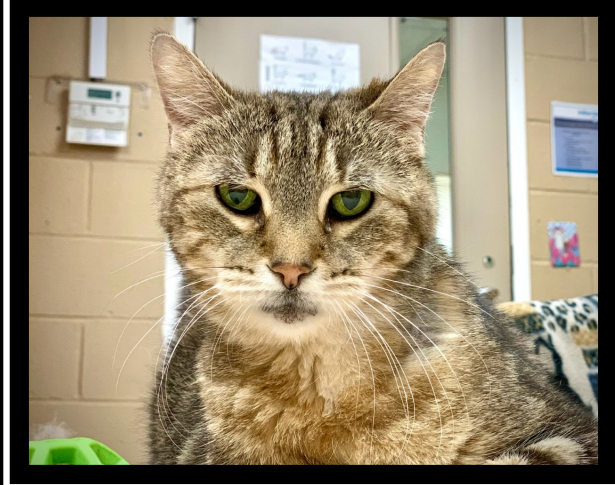
Amy - Special Needs Kitty

DAISY is a Chihuahua just under two years old. She is suffering from neurologic issues (probably due to a brain injury) that cause balance and walking challenges. However, she is a sweet dog that could do well in a home without stairs, children or rambunctious other pets.