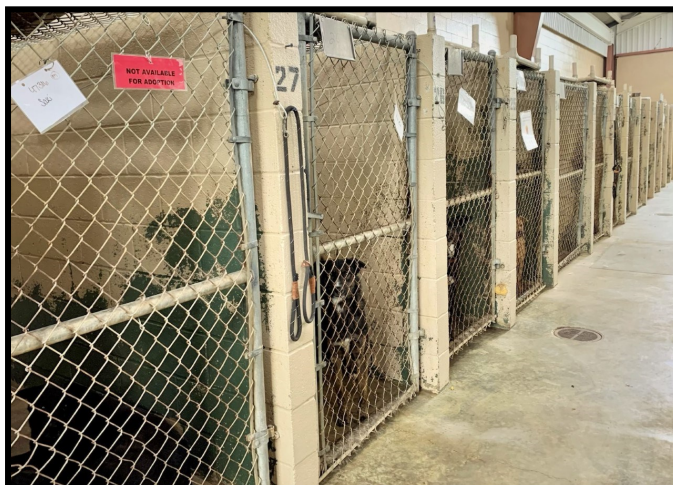
Main Kennel Before Renovation Began