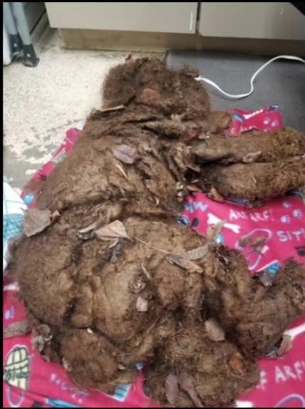
Bill's Condition Upon Intake