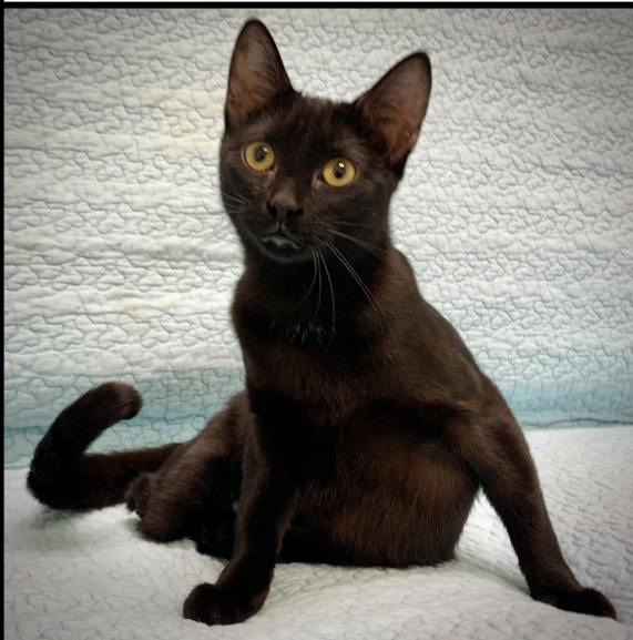
Mazzie - Special Needs Kitty

"Thank you so much for Bill. He's exactly who I needed, someone to spend time with me and get me out of the house to walk for rehab. Bill is a love bug. After we got home Bill explored the house, coming back to touch base with me every few minutes. I really needed to feel needed. Bill is perfect."