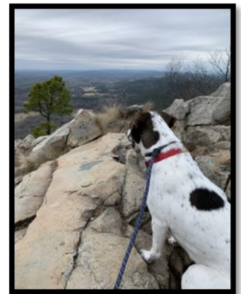
George on Pinnacle Mtn.

Carol , another very shy dog, showed up on our property last year. Though she also lacked trust, she caught the attention of a trainer from Service Dogs of Distinction, a group that trains service dogs for veterans with a variety of service related traumas. Despite her shyness, Carol exceeded expectations and was called a "definite gem" by her trainer just a few days into the program. She was matched with a soft spoken disabled veteran, and once again two lives were changed for good.